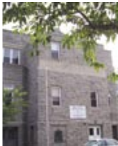
Homes for America is our development partner for Serenity Place