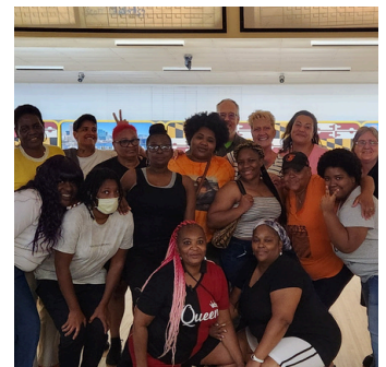
Residents at Bowling