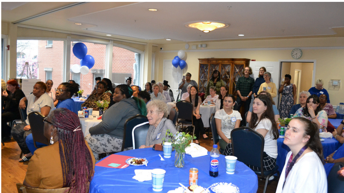
42nd Anniversary & Yield Giving Celebration

Christmas wishlists fulfilled by the generosity of hundreds of individuals, companies, and churches, making the holiday season truly magical.