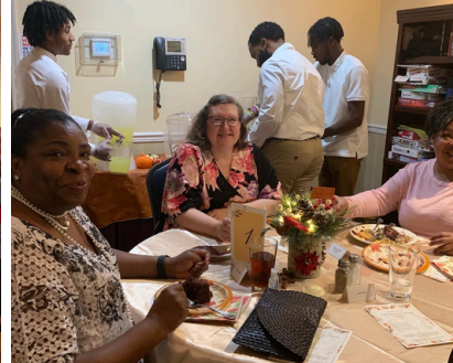
Residents & Staff at Thanksgiving