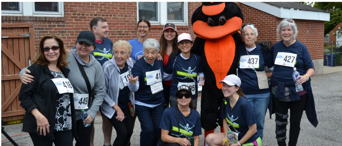
15th Annual Race to Embrace Independence 5K