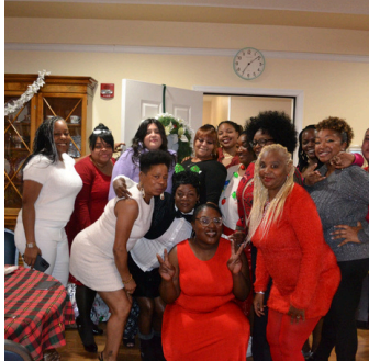
Residents at Holiday Party