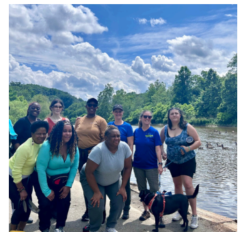
Resident Camping Trip