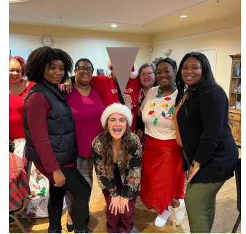
Residents at Holiday Party