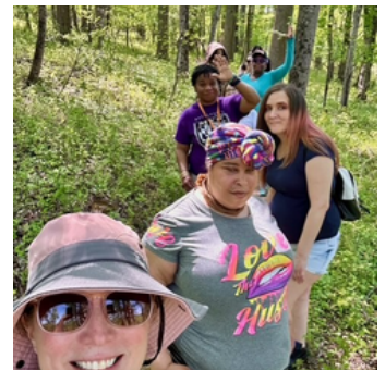
Resident Camping Trip