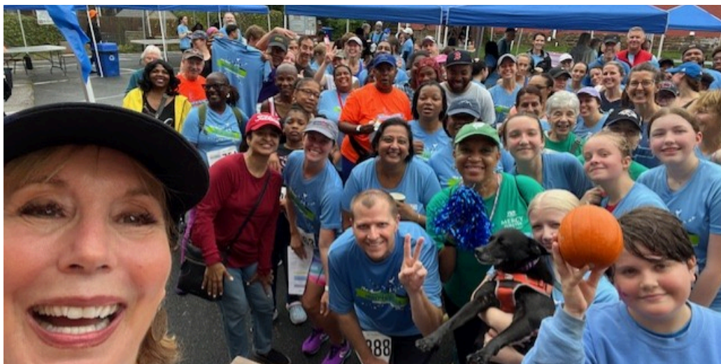
16th Annual Race to Embrace Independence 5K