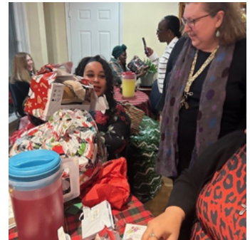
Residents at Holiday Party