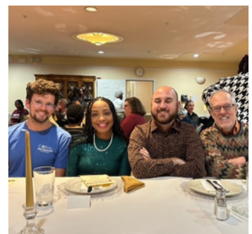
Thanksgiving ANNUAL REPORT 2025