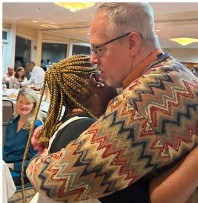
Residents & Staff at Thanksgiving