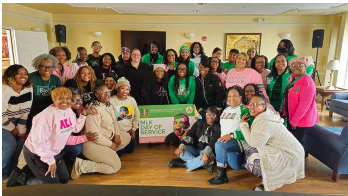
Martin Luther King Day