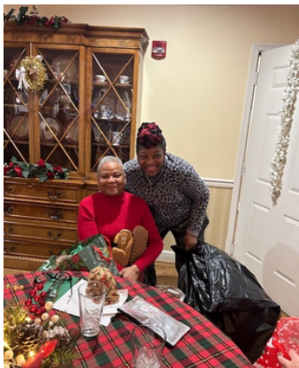
Residents at Holiday Party